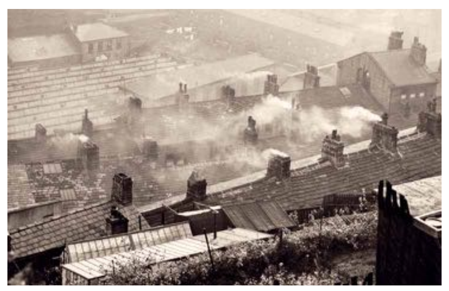
Looking over the roof tops of High Street.