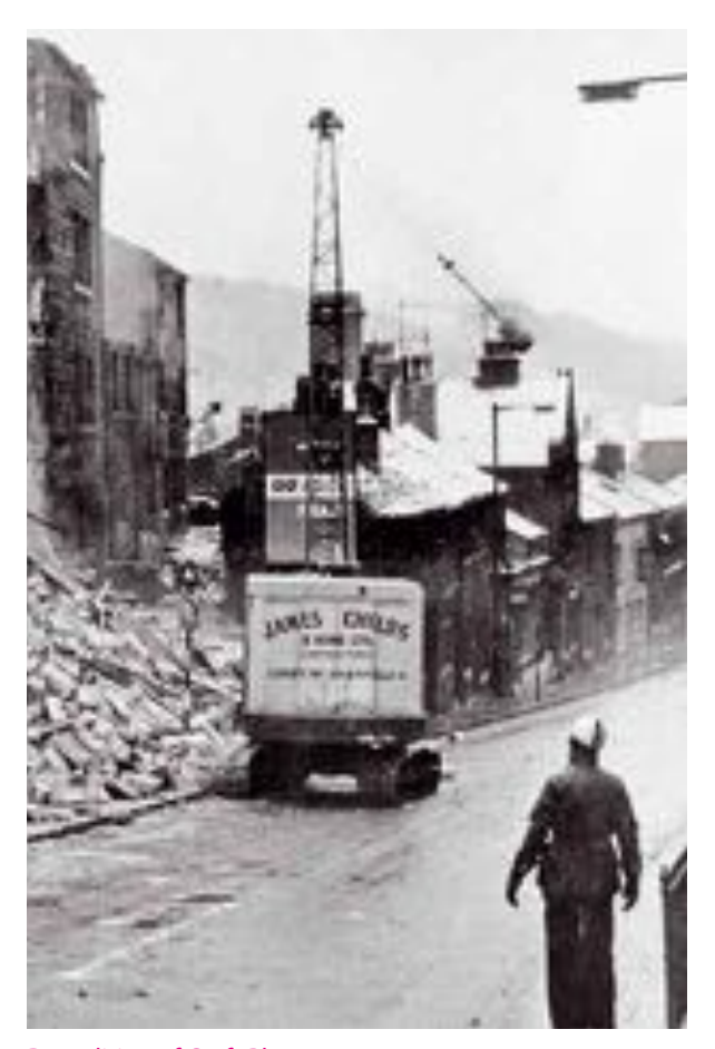
Demolition of Croft Place, 1963