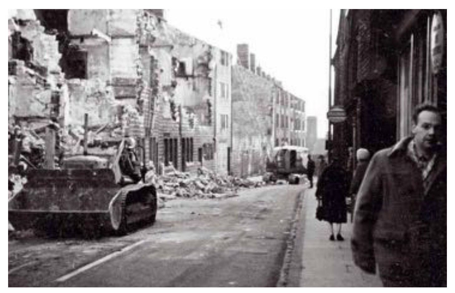
Houses on the north side of Bridge Lanes being demolished in April 1964.