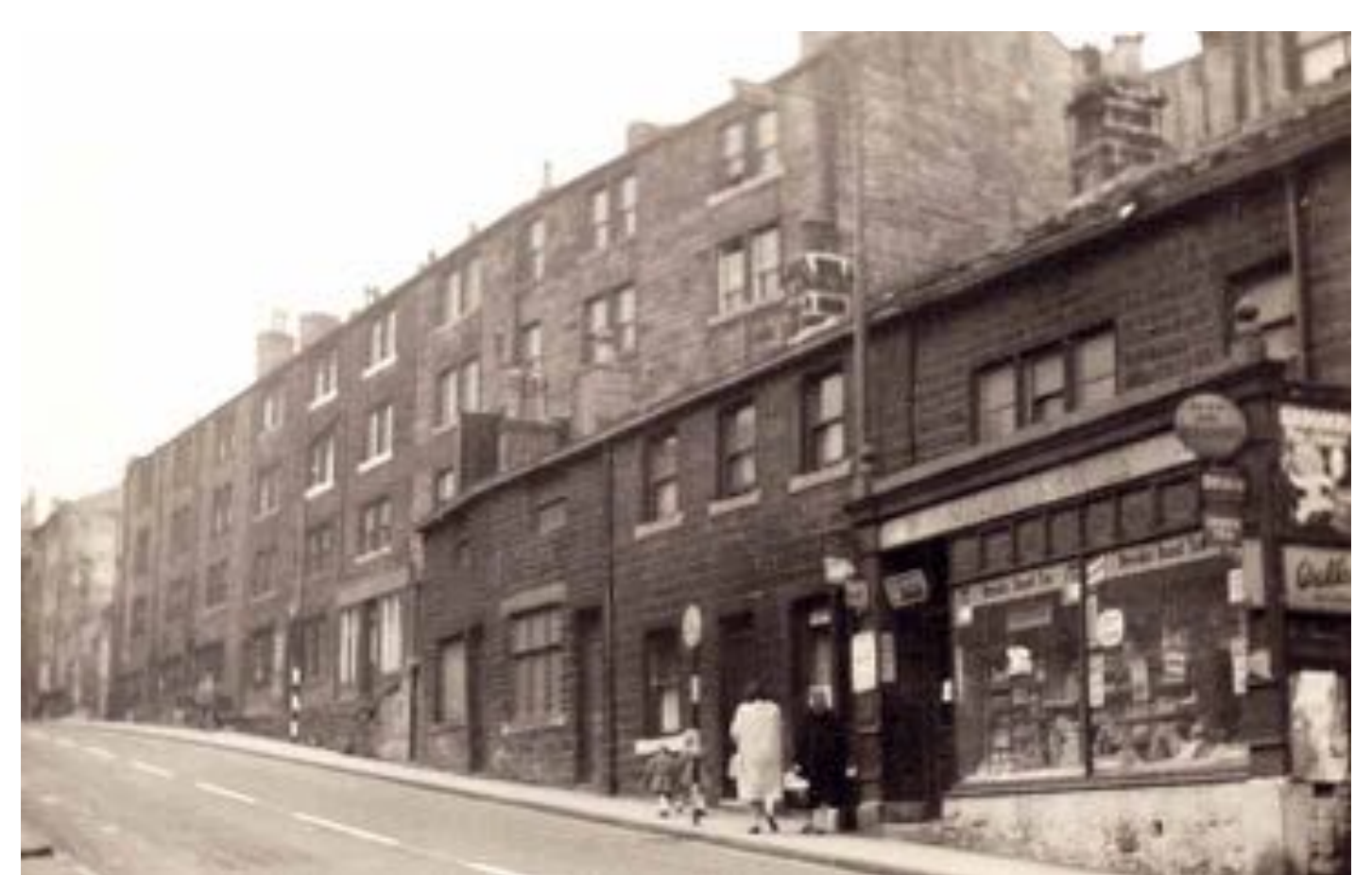
The north side of Bridge Lanes. PHDA - Alice Longstaff Gallery Collection