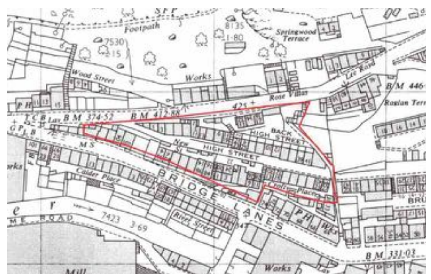
1961 map showing houses at High Street and Bridge Lanes