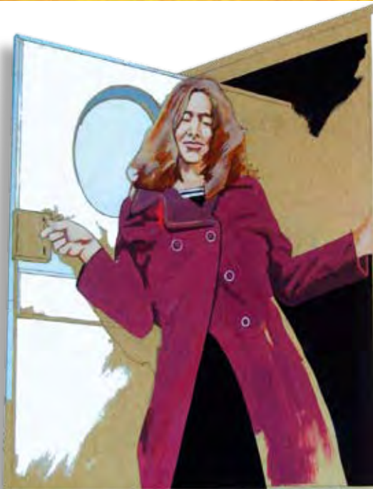
Image from 'Born in a Barn' CD cover